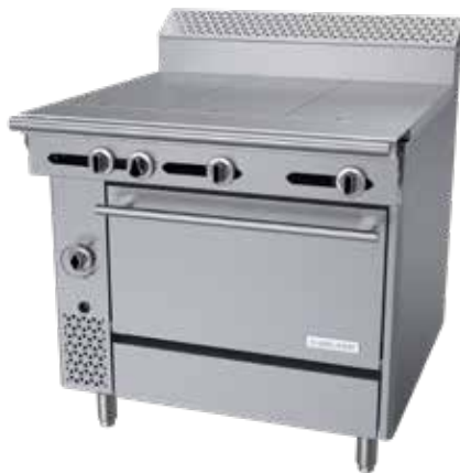
Model C36-8R Range with Three 12" Even-Heat Hot Tops