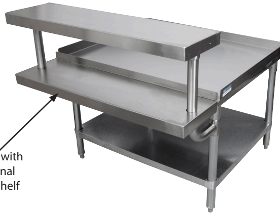
Shown with Optional Plate Shelf

Use your smart phone to scan the above QR code to visit our website: www.bk-resources.com