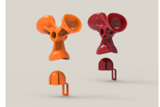
Juice extraction kit

Optional- Extra large(XL): Pink; Small (S): Grey; Large (L): Maroon.