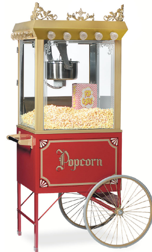
Model 2119 Popper shown on 3118PC Cart for reference only (cart sold separately)