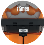
New integrated cover