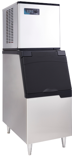
ICETRO IM-0350-22 ice machine on a IB-026-22 bin