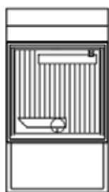
PAR-2 Heat Exchanger