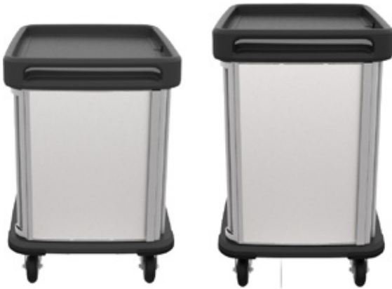
Products on the picture are shown with the optional corner bumpers.