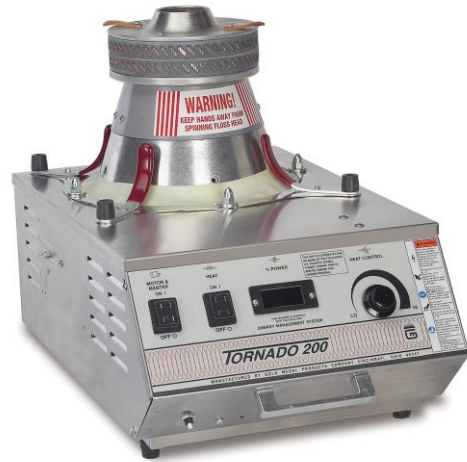
Floss Unit View without Pan