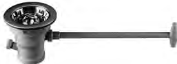
polymer rotary drain