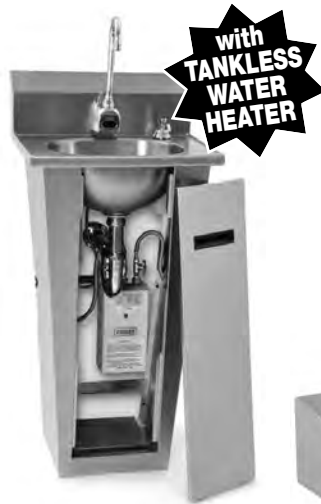
hand sink with hot water heater