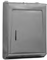
model #318496 towel dispenser

Hand Sink Accessories & Options—Miscellaneous