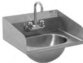
hand sink with optional end splashes