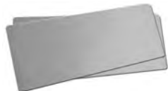
pair of end splashes for field installation