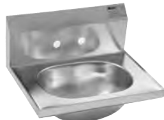
hand sink with electropolished finish

Item No.: _____ Project No.: _____ S.I.S. No.: _____