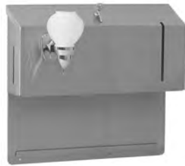
model #DP-10 towel dispenser