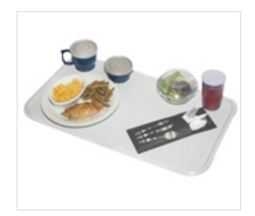
High Heat Application Suitable for high temperatures

Features a channel in the middle and supports double-sided cold and hot retherm applications