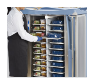
Retherm Use Designed for use in Thermal Aire III and Meals On Command II retherm systems