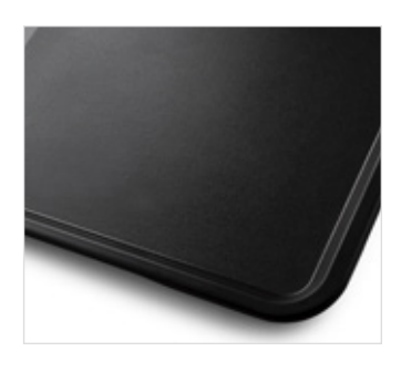
Raised Edge Provides a subtle barrier to keep traytop items contained