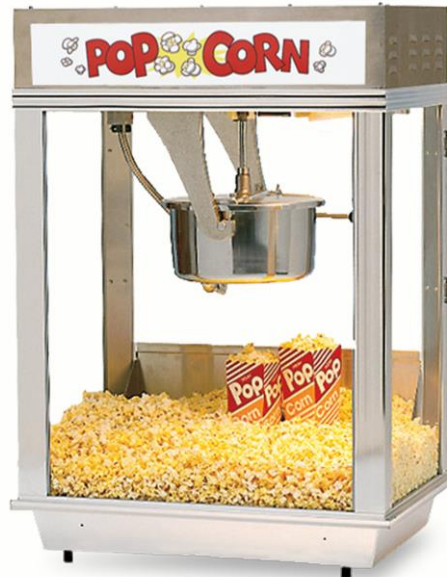
General reference image shown.