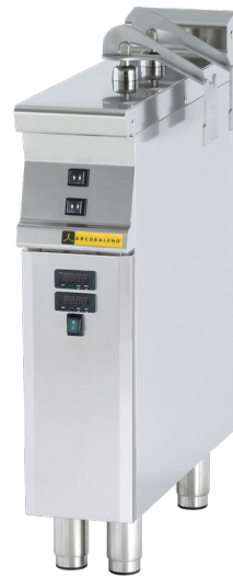
APCL28 2 Lifters