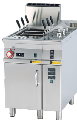
APCL35 (Lift) Electric Only