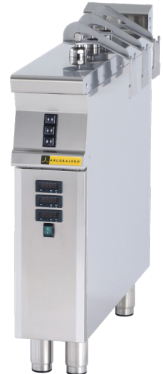
APCL35 3 Lifters