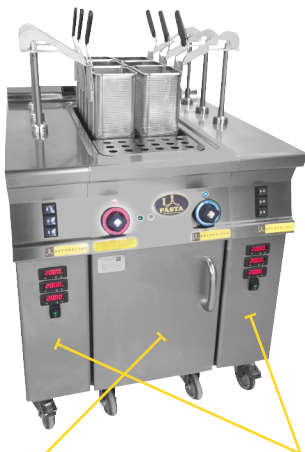
Pasta Cooker Electric Or Gas