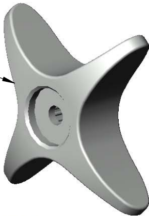
002521-45NS 4-Arm Handle