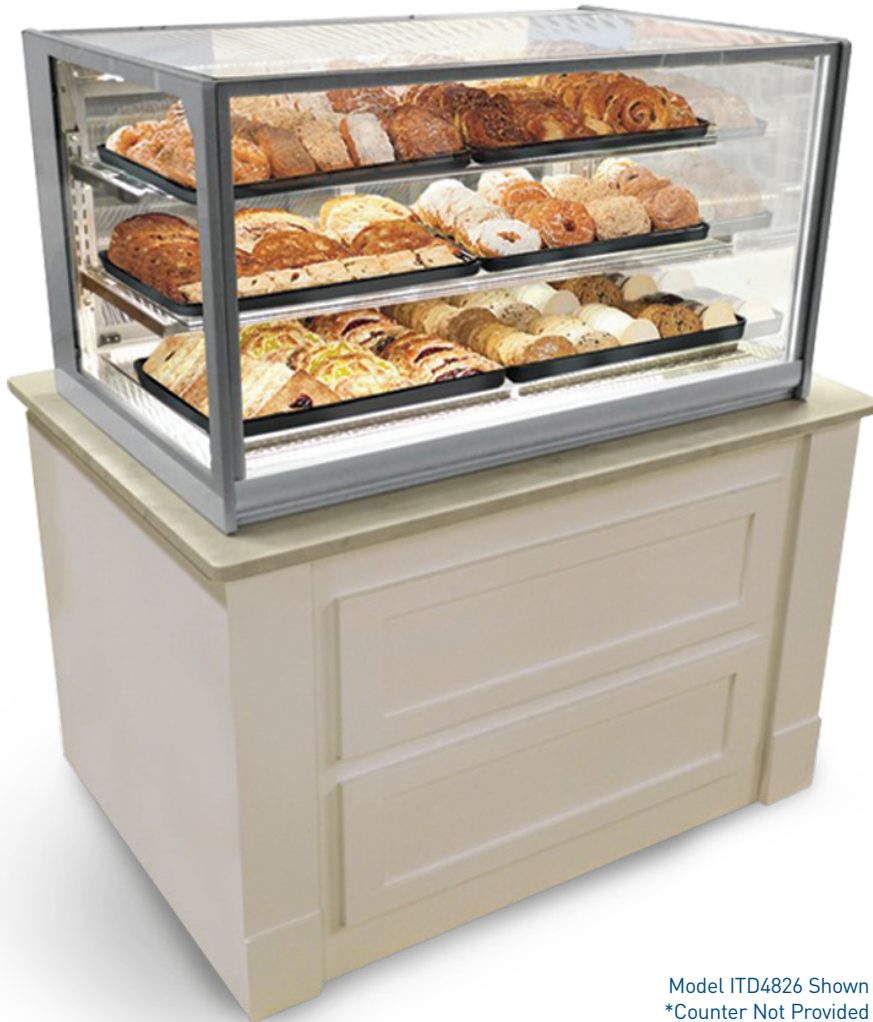
Model ITD4826 Shown *Counter Not Provided

Designed for customers looking for rich, up-scale Italian styling for maximum visual appeal that will drive product sales.