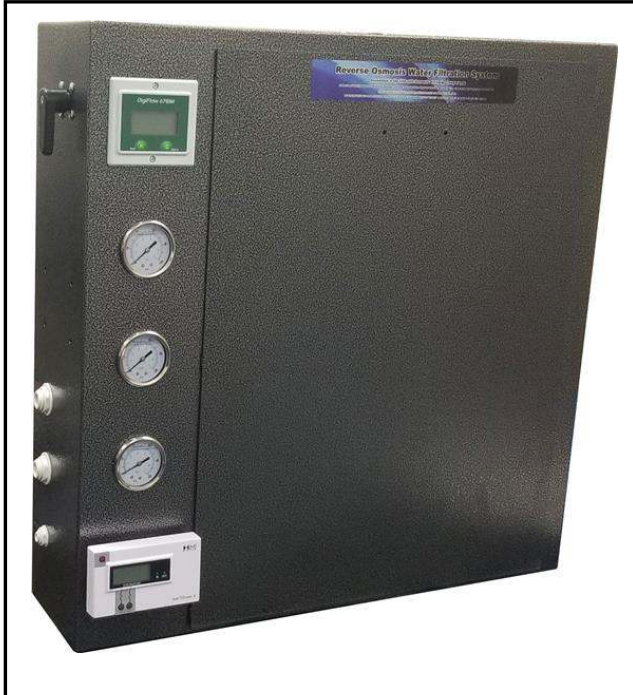
9R011B (9R011B) Reverse Osmosis Water System