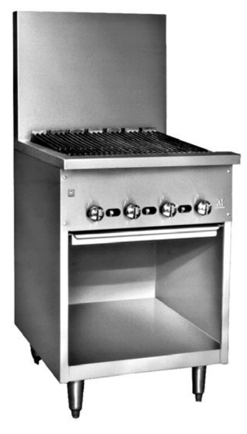
JBR-24B with optional high riser