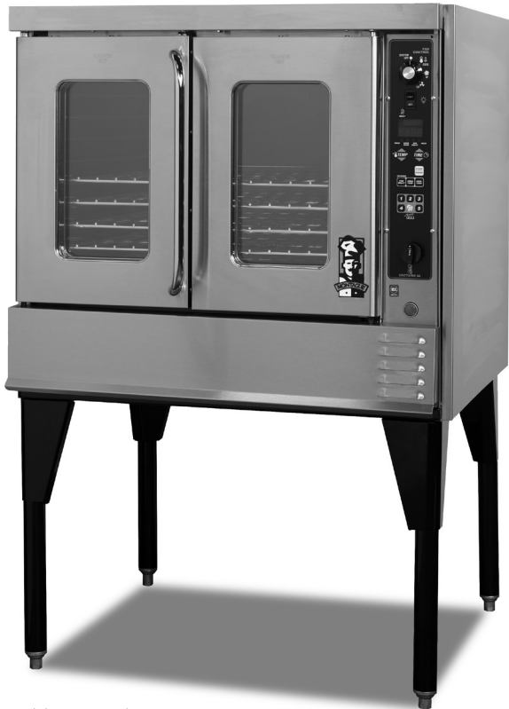
Model SL70-AP shown