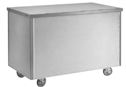
Model RAN ST-4 shown