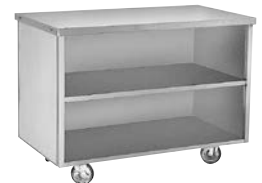
Model RAN ST-4S shown