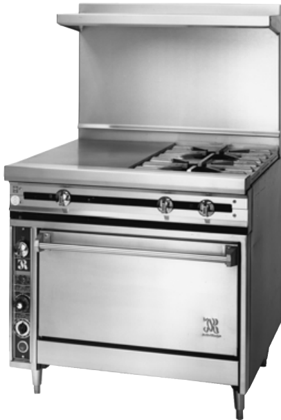
JTRH-1HT-2-36C with stainless steel high shelf

Obtain model number by inserting the corresponding suffix (from Suffix Guide) in blanks provided below.