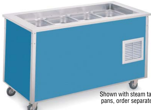
Shown with steam table pans, order separately.