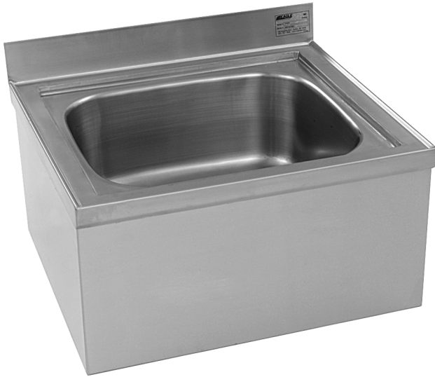
#F1916 mop sink

Eagle Floor Mounted Mop Sink, model _____. Constructed of type 304 stainless steel, with 8" or 12" deep-drawn covered corner sink with drain and flat strainer plate.