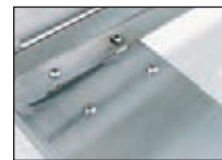
High strength heliarc welded ledges.