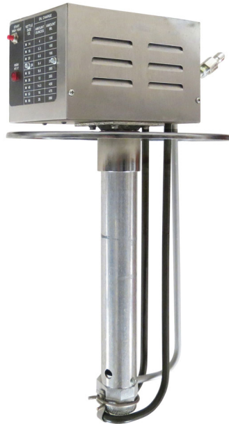
General image shown for reference.