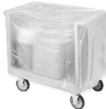
Adjustable Tray and Dish Cart with Vinyl Cover