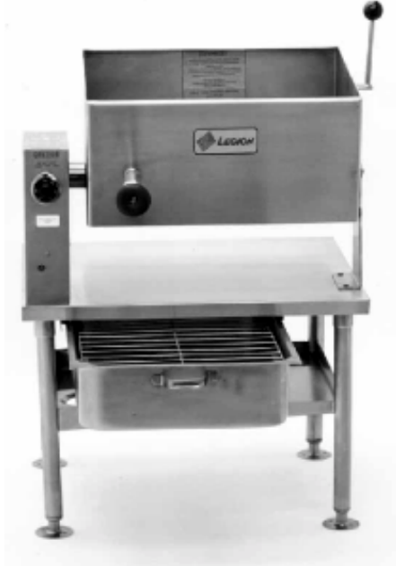
Model RES-1824-9 with optional 1 1/2" draw-off and table