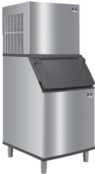
RNK-1100A Nugget Ice Machine on D-570 Bin