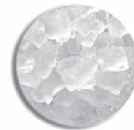
Ice shown actual size

Nugget ice consists of small pieces ranging from 0.95cm to 1.27cm in width and length. Offers a 85% ice to water ratio with a soft, chewable texture while still providing maximum cooling effect and dispensability.