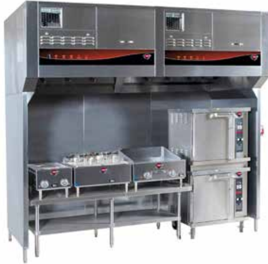
Model WVU-96 (equipment sold separately)