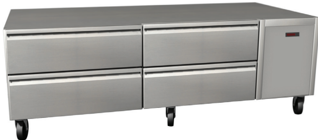
Model 20072RSB with optional casters