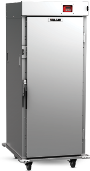
Model VBP18ES - CBFT