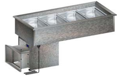
Model RCP-4 shown