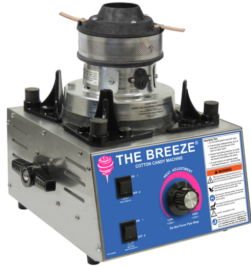
Unit view without Floss Pan