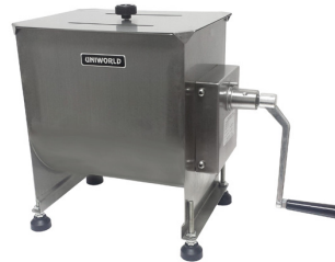
MMX02 STAINLESS STEEL MEAT MIXER COMBO ITEM# MG22E-MMX02