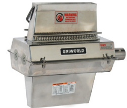
MTA74 S/S MEAT TENDERIZER ATTACHMENT COMBO ITEM# MG22E-MTA74