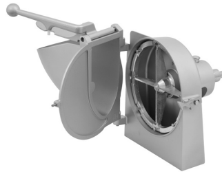
UVS-9DHN SHREDDER/GRATER ATTACHMENT COMBO ITEM# MG22E-9DHN