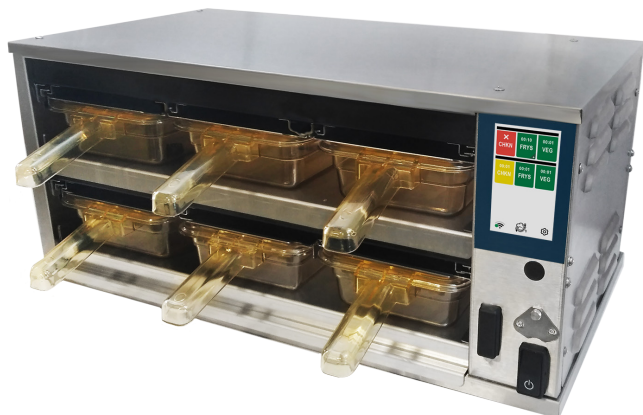
Model – RFHU-23 2.5" Deep