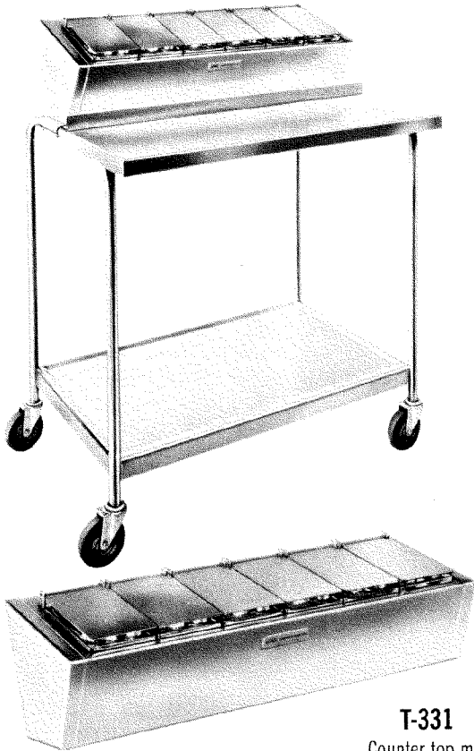
T-331 Counter top model.