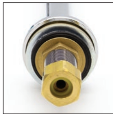
BOTTOM VIEW 1/2" NPS MALE INLET