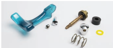
K-02 (If purchased from 2016 - 2019)