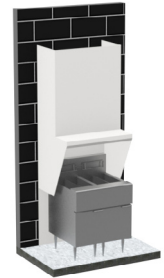
Model SSA-FRYER2-16 shown