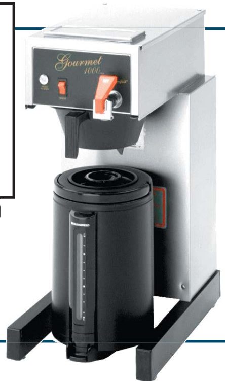
Model 8788/8782 shown with optional 7752