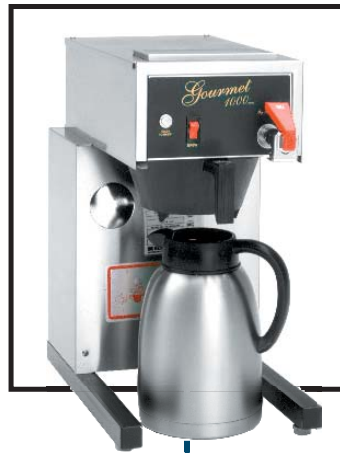
Model 8782XL shown with optional 7874

Airpot Coffee brewers offer volume brewing, proper extraction and holding capacity in a limited space. The 8782XL, at an extra low height of only 17 3/4", is sure to fit in those tight counters. These uniquely designed units eliminate flow control problems, and resist clogging in adverse water conditions. Coffee is brewed into a thermal server or airpot for easy transport to remote serving areas where the coffee will be preserved for optimal temperature and taste.