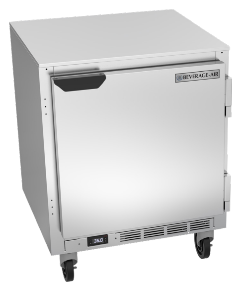
Note: Shown with optional full electronic control

7 Year Parts/Labor Warranty7 Year Compressor Warranty