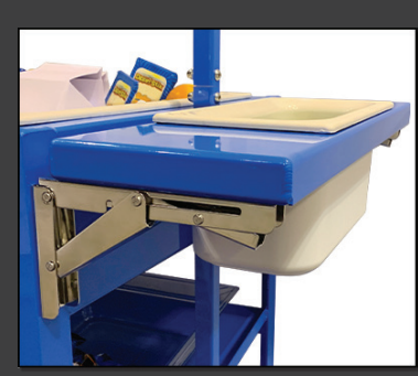
Optional Cold Pan Shelf (#52918BLUE)