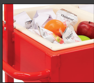
Comes with HACCP compliant cold food pans.