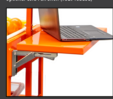
Optional Solid Shelf (#529190RANGE)