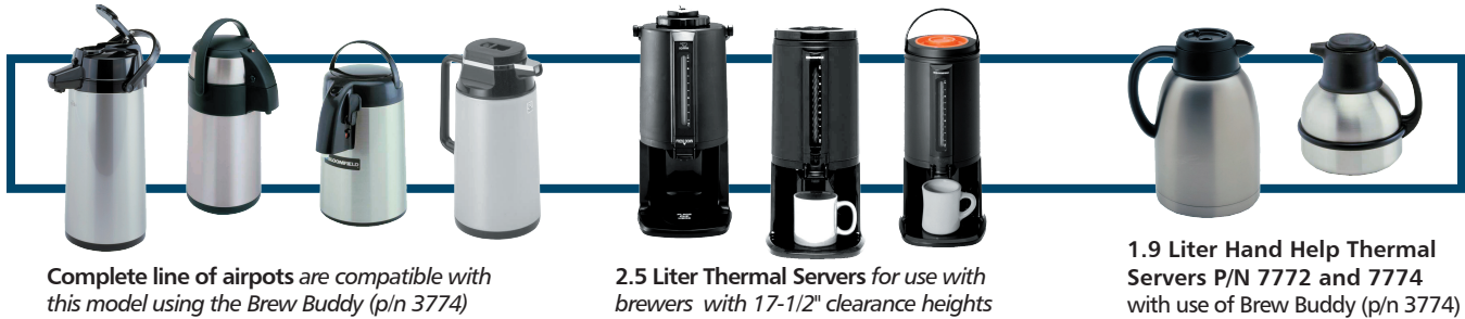
Complete line of airpots are compatible with this model using the Brew Buddy (p/n 3774)

ACCESSORIES: See the Bloomfield Brew product catalog for a complete listing of brewers and accessories.