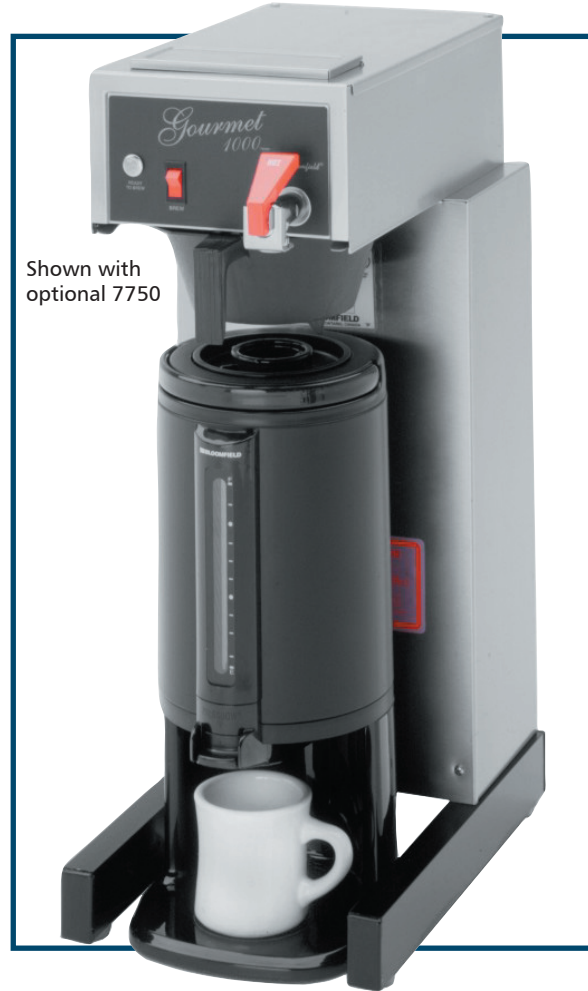
Shown with optional 7750