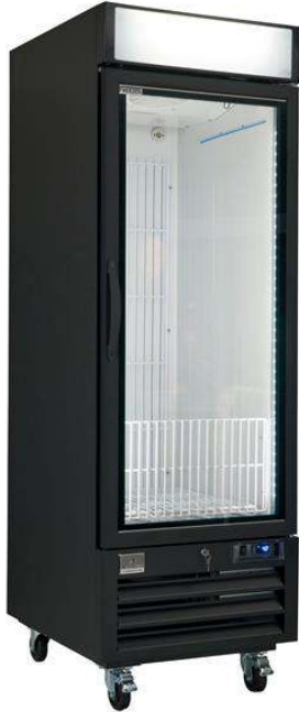
738321 (KCHGICM23FB) 1-Hinged Glass Door Full Height Ice Cube Merchandiser Freezer 26.75" Long