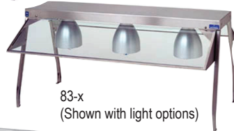
83-x (Shown with light options)