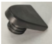
2 Front Footpads