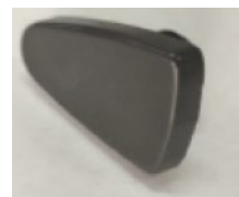
2 Rear Footpads