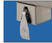
Knee Valves Included On All "KV" Models