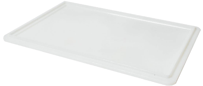
Available in White