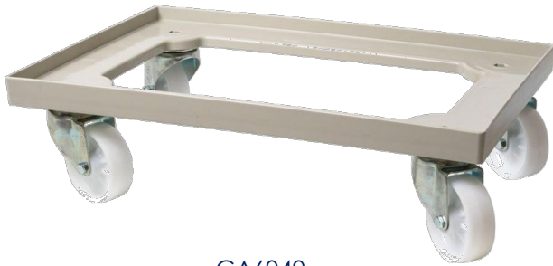
CA6040 Heavy duty 4 casters (no brakes)