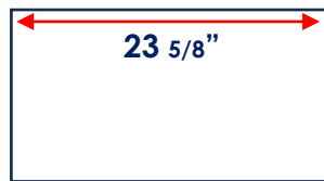
VAS007, 010, 013 Full Size Box