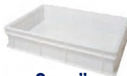
3 1/2" 10 cm