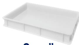
2 3/4" 7 cm