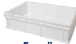
5 1/5" 13 cm