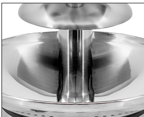
Polished stainless steel