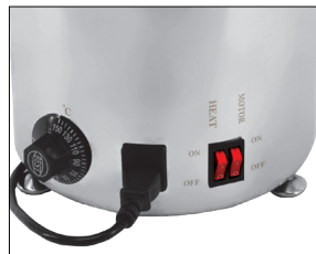
Temperature & motor control