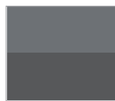
Titanium Gray/ Charcoal