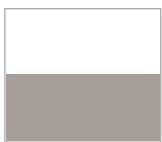
Glacier White/ Linen

The Moon sidechair features a low backrest with a wide ergonomic seat. Easy to handle and move around patios and terraces.