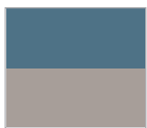
Denim Blue/ Linen