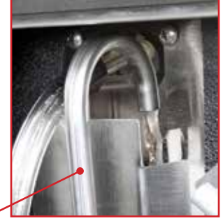
Incoming water line has built-in air gap so no separate vacuum breaker accessory is required