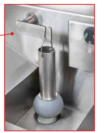
Drain stopper is controlled by a quiet and reliable gear motor with linkage cam instead of a noisy solenoid valve