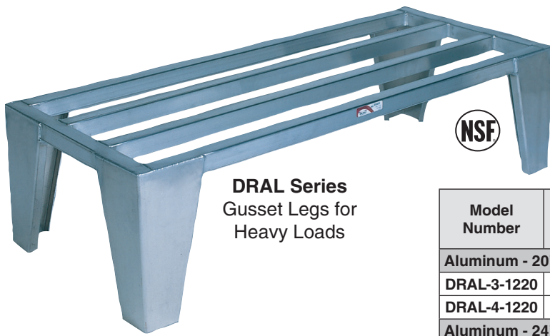
DRAL Series Gusset Legs for Heavy Loads